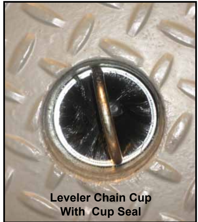
Leveler Chain Cup With Cup Seal