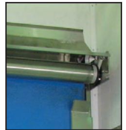
Hinged drip guard lifts up for easy cleaning