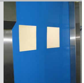
Shown with optional windows

Standard maximum sizes shown; larger sizes may be available upon request.