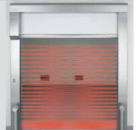
Ry-Beam Light Curtain