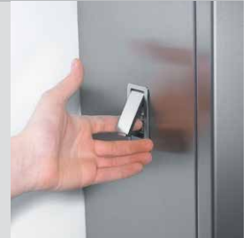
Flush manual release