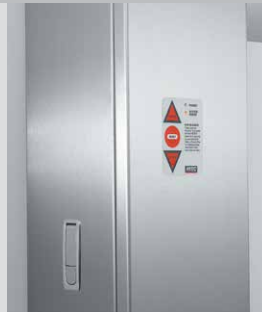
Flush membrane switch allows controls to be mounted remotely