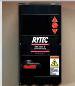
System 4 shown with optional rotary disconnect