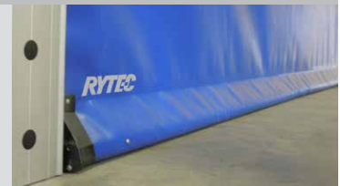
Tight seal and clean appearance