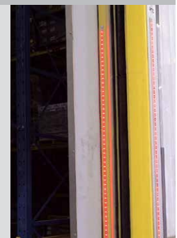
Pathwatch warning lights