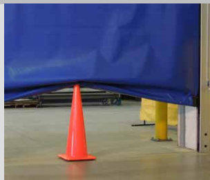
Flexible edge flexes around objects