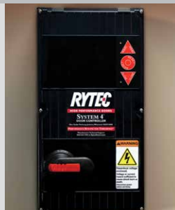
System 4 shown with optional rotary disconnect