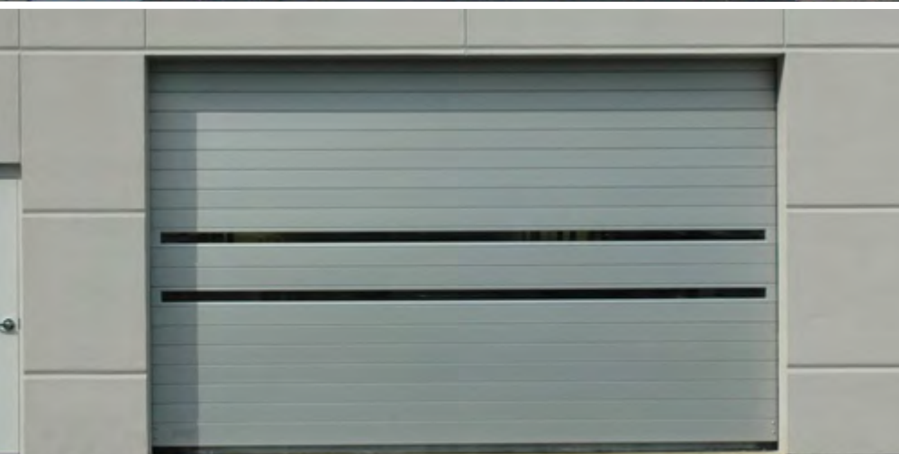
Full Vision and Standard Spiral Door Panel Configurations Shown