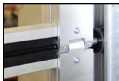
Rollers with sealed roller bearings